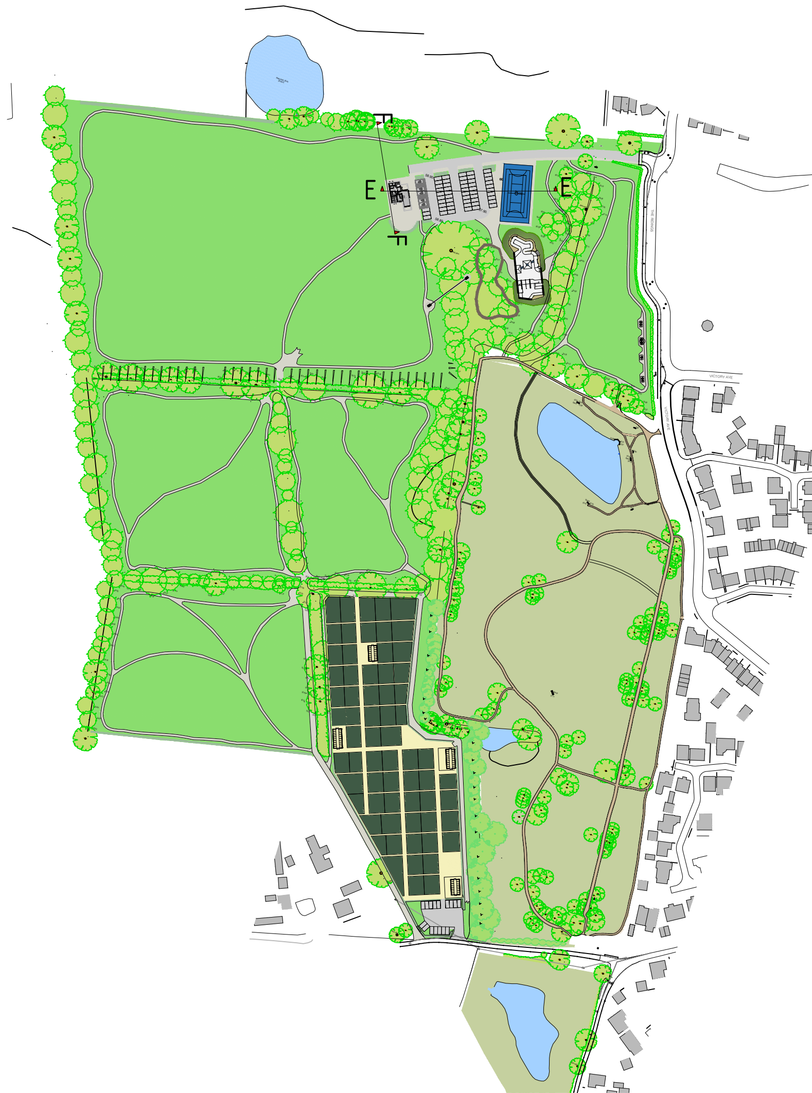
SITE PLAN 1 : 2500